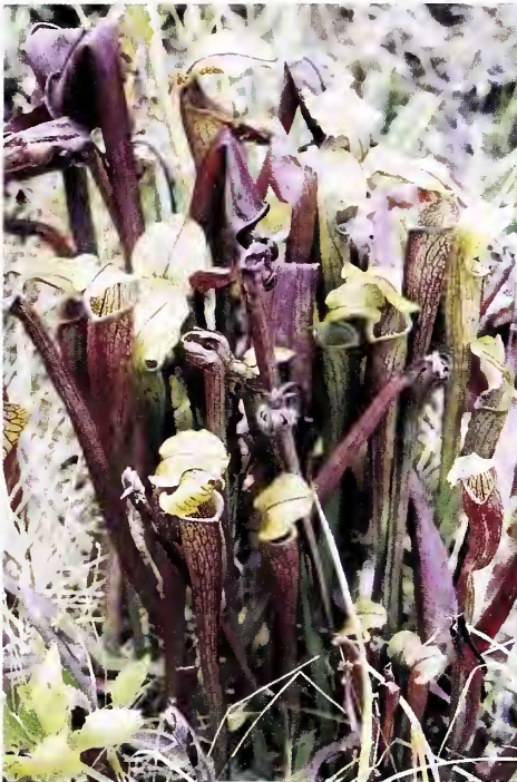
Figure 3: Sarracenia 'John's Autumnal Splendor'